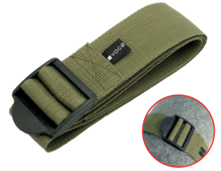
K6 11176 / K10 11176